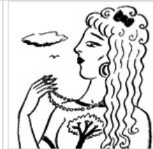
Op-Ed: The World's Tallest Woman