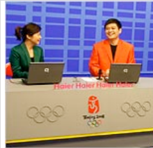
Olympics Are a Ratings Bonanza for Chinese TV