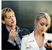
Serious Pleasures: Season's Sweet Spots